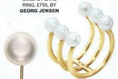
GOLD & PEARL RING, £750, BY GEORG JENSEN