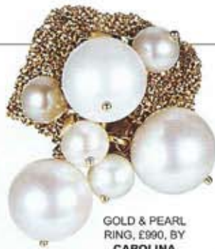
GOLD & PEARL RING, £990, BY CAROLINA BUCCI