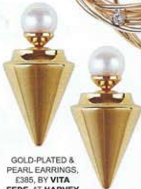
GOLD-PLATED & PEARL EARRINGS, £385, BY VITA FEDE, AT HARVEY NICHOLS