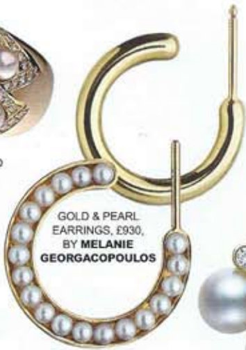
GOLD & PEARL EARRINGS, £930, BY MELANIE GEORGACOPOULOS