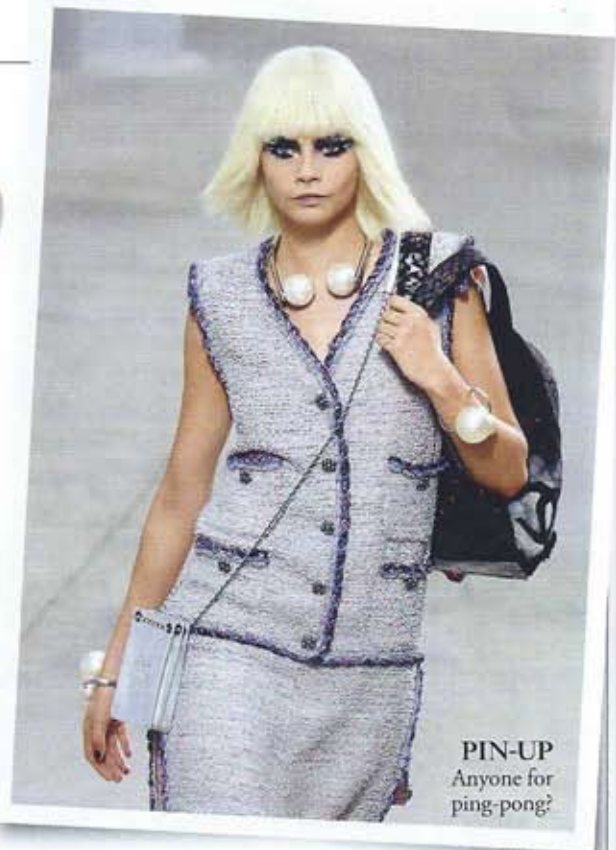
PIN-UP Anyone for ping-pong?