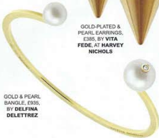
GOLD & PEARL BANGLE, £935, BY DELFINA DELETTREZ