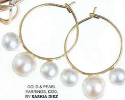
GOLD & PEARL EARRINGS, £220, BY SASKIA DIEZ