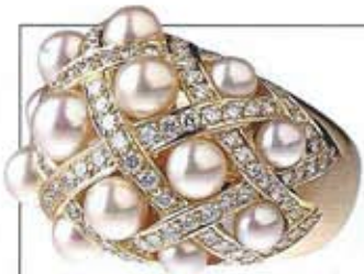
GOLD, DIAMOND & PEARL RING, £7,000, BY CHANEL FINE JEWELLERY