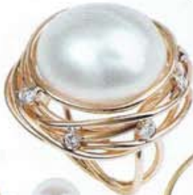
ROSE-GOLD, DIAMOND & PEARL RING, POA, BY NOURBEL & LE CAVELIER