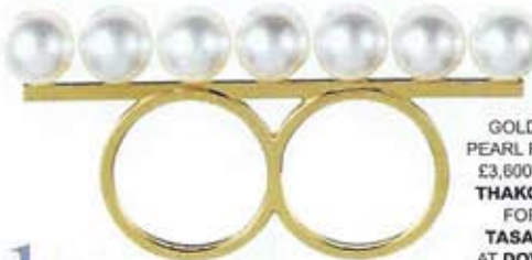
GOLD & PEARL RING, £3,600, BY THAKOON FOR TASAKI, AT DOVER STREET MARKET