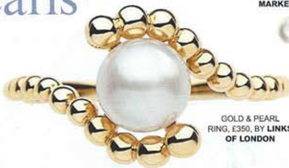
GOLD & PEARL RING, £350, BY LINKS OF LONDON