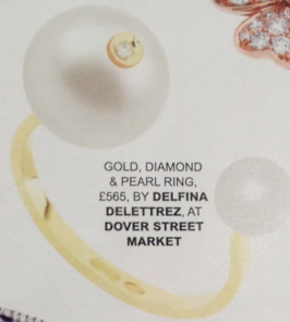
GOLD, DIAMOND & PEARL RING, £565, BY DELFINA DELETTREZ, AT DOVER STREET MARKET