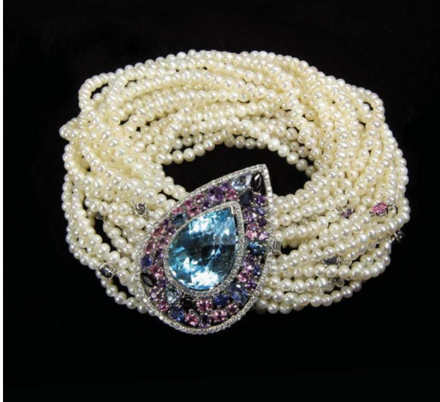
CLOCKWISE FROM LEFT Bracelet with blue topaz, sapphires and baby pearls, KINETIC ARTWORK; Tai Mee bracelet with rubies and diamonds set in 18k rose gold, CASATO; Peacock bangle with blue sapphires, green garnets and a black diamond, CHRISTELLE; Bangle with Gemfields’ Zambian emeralds, NAM CHO; Green and black jade bangle with diamonds set in 18k white gold, EDWARD CHIU