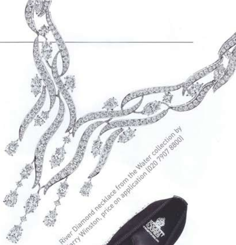
River Diamond necklace from the Water collection by Harry Winston, price on application (020 7907 8800)