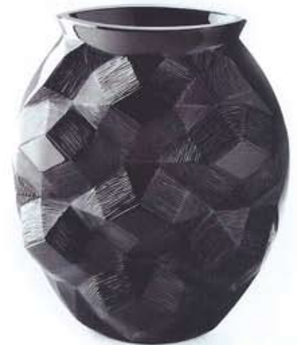
Turtle vase in black crystal by Lalique. Limited to 999 pieces, price on application (020 7292 0444)