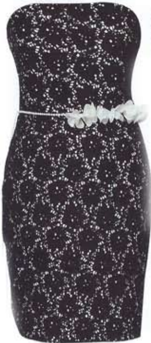
Black lace dress by Luna Sky, £375. Available at 59 Strings ( www.59strings.com )