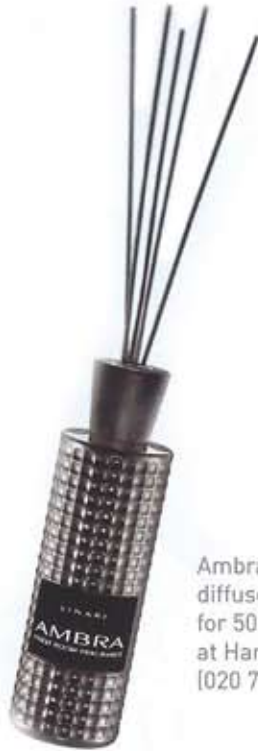
Ambra reed fragrance diffuser by Linari, £89 for 500ml. Available at Harrods (020 7730 1234)